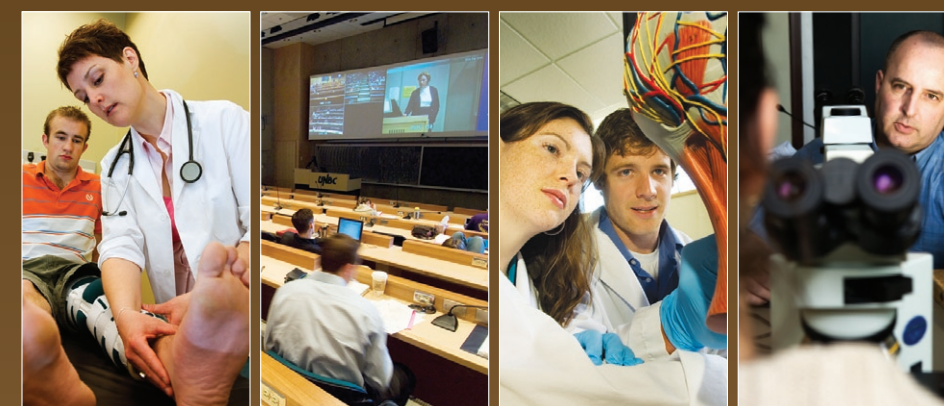
NMP students during the course of their studies

The NMP isn't just the sum of what can be achieved when UNBC and UBC work together. Rather, it's significant because it provides evidence of what can be achieved when communities, physicians, health authorities, governments, and educators all work together.