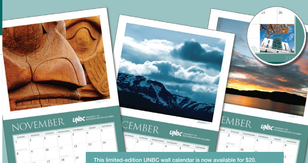
This limited-edition UNBC wall calendar is now available for $20. Proceeds support students directly through scholarships and bursaries.

Purchase your copy from the UNBC Bookstore at (250) 960-6424 or contact the Office of Advancement for information on bulk order discounts.